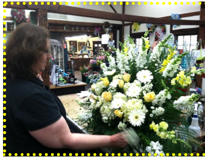
Beautiful Floral Arrangement from Cityline Florist

Detail Reports. Incoming call data is automatically associated with ongoing marketing campaigns. With these sales reports, Cityline Florist adjusts and maintains a knowledge based