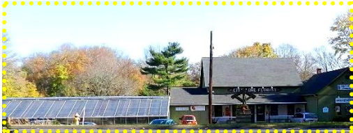
Cityline Florist, Trumbull, CT

INFO: CLIFF.FERGUSON@ABTELEPHONE.COM HOWARD.SMALL@ABTELEPHONE.COM