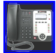
IPitomy 220 IP Set

Thank you for the opportunity to provide this quote for your review and consideration. Please feel free to call or email with any questions at anytime!