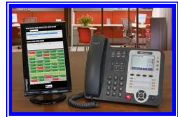
IPitomy 320 Set with VIP Sidecar