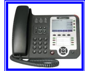
IPitomy 320 Qty. 10