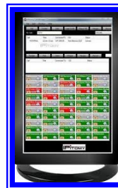
VIP PANEL Optional