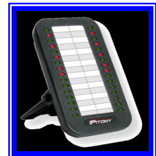
IPitomy Sidecar (Model 410 & 620 only)