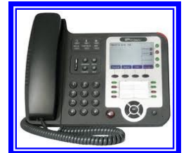
IPitomy 410 IP Set