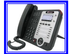
IPitomy 320 IP Set