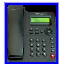
IPitomy 210 Set Qty. 06